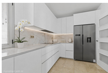
Furnished with AI