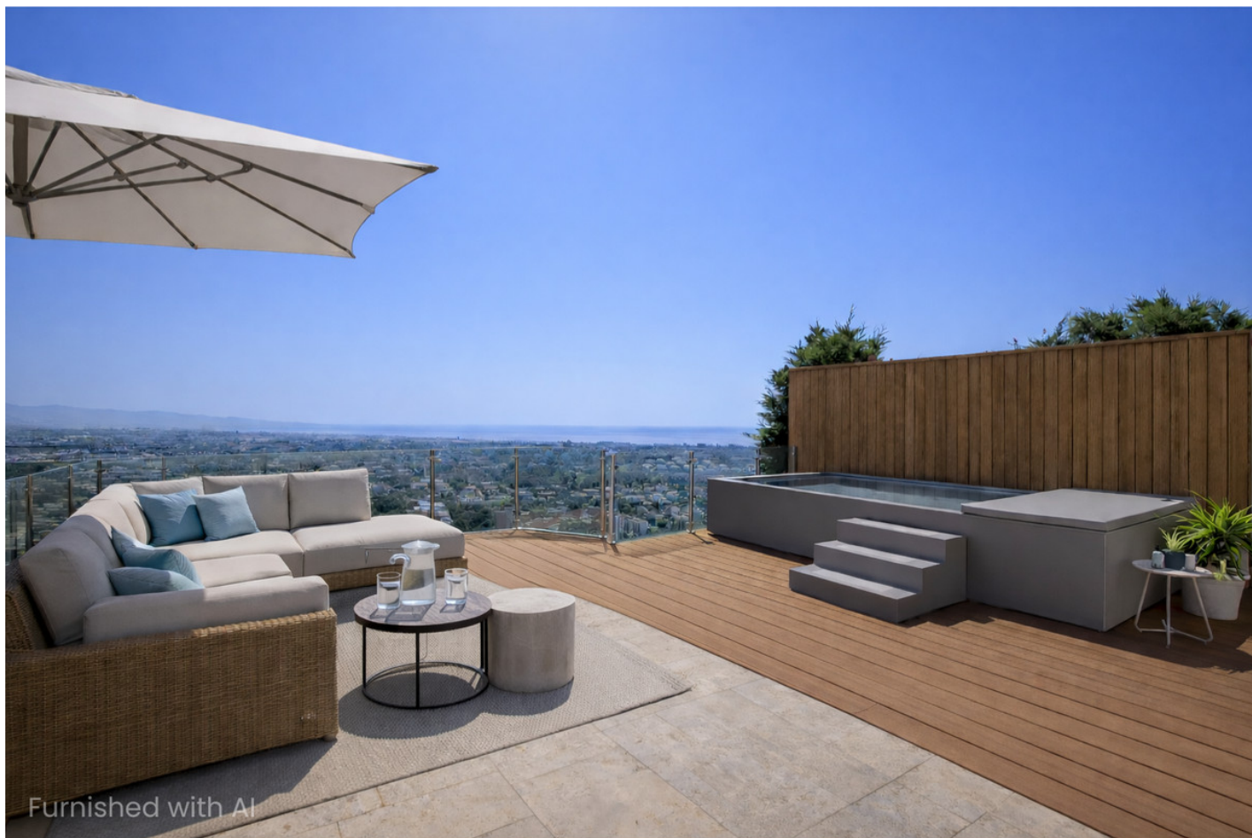
Furnished with AI