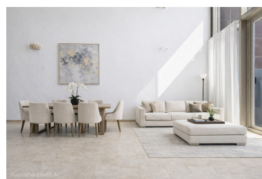
Furnished with AI