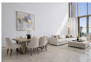
Furnished with AI