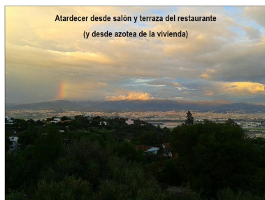
Atardecer desde salón y terraza del restaurante (y desde azotea de la vivienda)